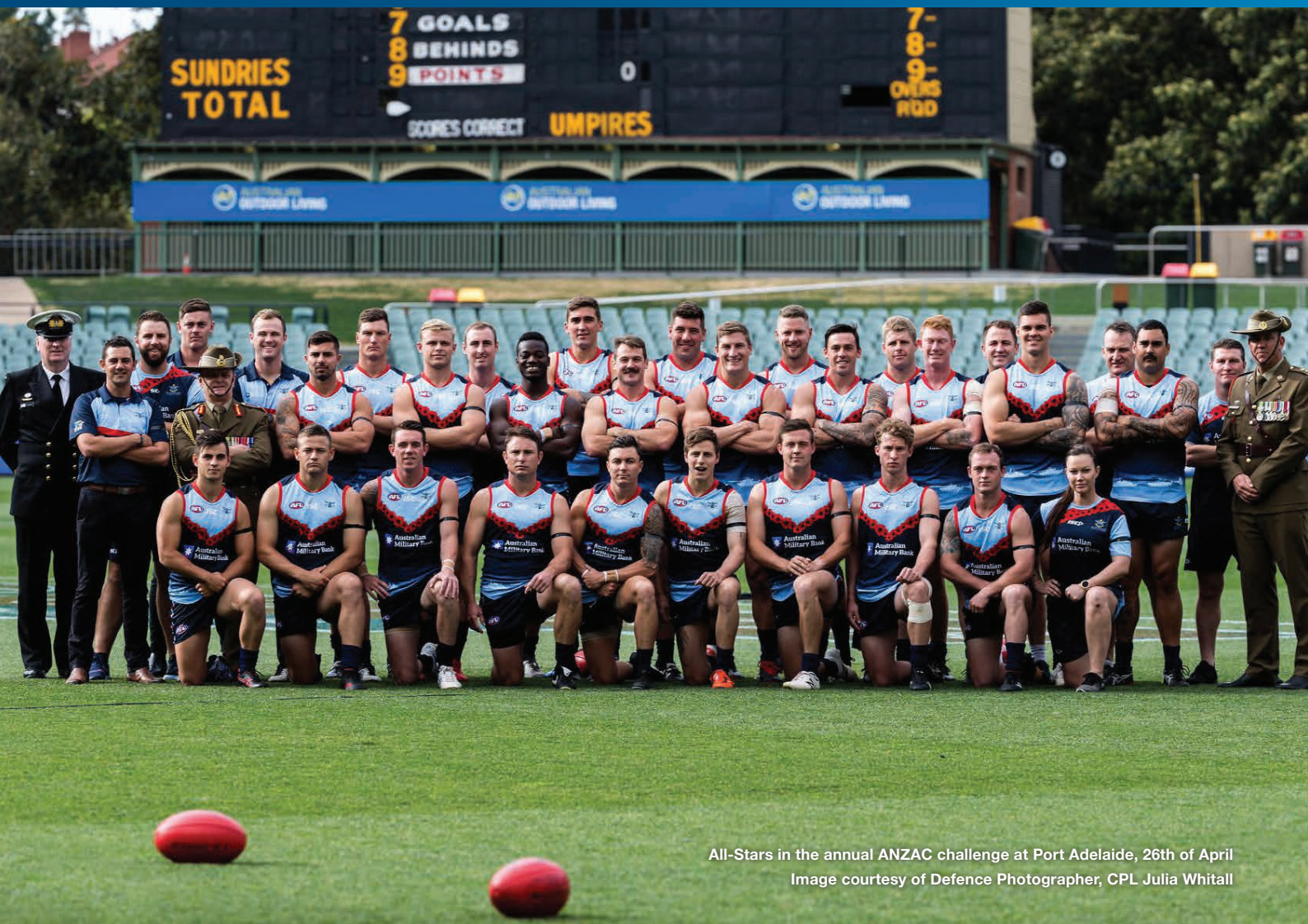
All-Stars in the annual ANZAC challenge at Port Adelaide, 26th of April